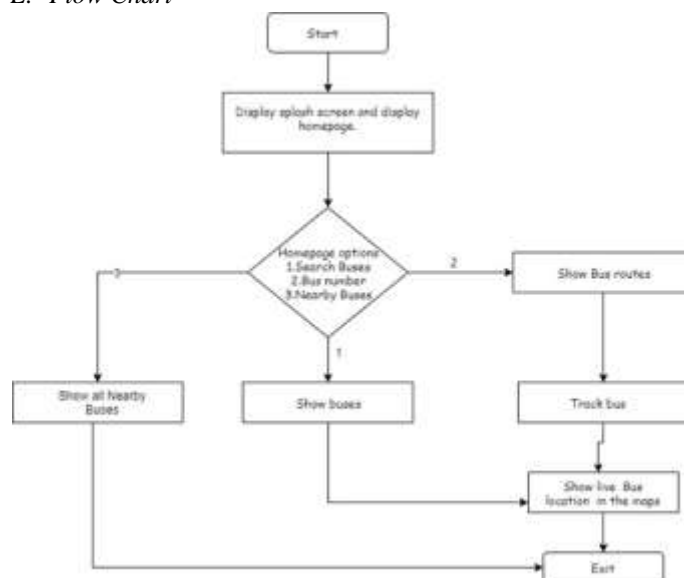
Figure II. Flow Chart