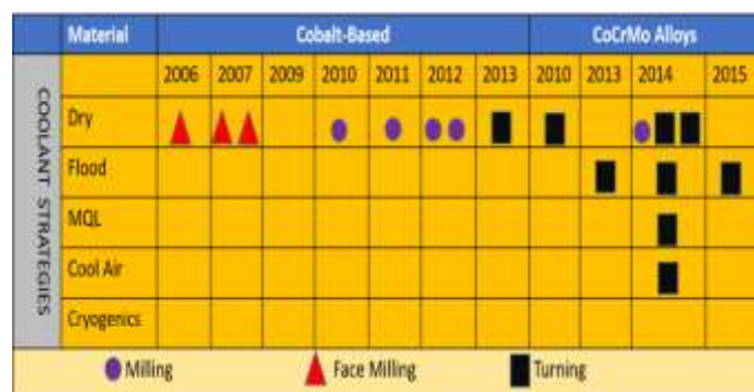
Fig 2. Coolant strategies for Co-based alloys

Researchers studied the effects of coolants on cutting forces, cutting temperature, and wear at tool-chip interface [1, 15]. Many researchers used dry machining as compared to minimum quantity lubrication, air cooling, flood cooling and cryogenics on cobalt based alloys as shown in fig 2. In engineering or medical applications, surface integrity is very important aspect. Karpuschewski et al. [16] stated surface integrity using ceramic tool by the effect of different cooling systems on cobalt based alloys.