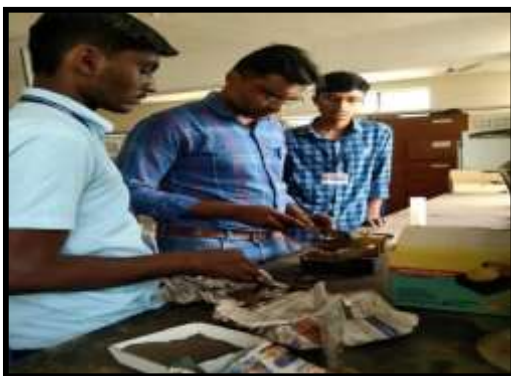
Fig 9 : Liquid limit test Performed