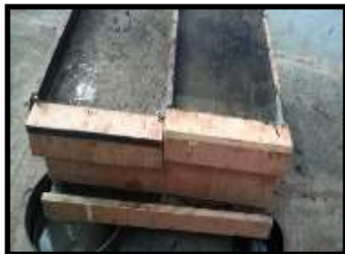
Fig 12 : Water percolation test on model