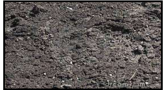
Fig 7 : Black cotton soil

this vomit paradox. The wet ones are narrow at the bottom and wide at the bottom. The basic condition of the soil was to build in such soils. A special method of laying the foundation is required in such soils.