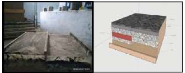
Fig 12 : Model with using brick dust