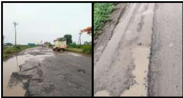
Fig 7 : No Drainage system

There is no drainage system. So the water that falls on the road. That water is stored on the road and it is percolate into the road. Percolated water create movement in sub grade course (i.e changes properties of black cotton soil). And cracks and potholes form in the road.