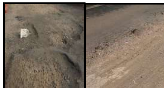
Fig 6 : Potholes

Due to insufficient strength in single or more layers of roadway, usually due to the occurrence of water, pits are formed when the pavement degrades in the loading of traffic. Most of the pits will not happen if the root cause is repaired before the pits develop.