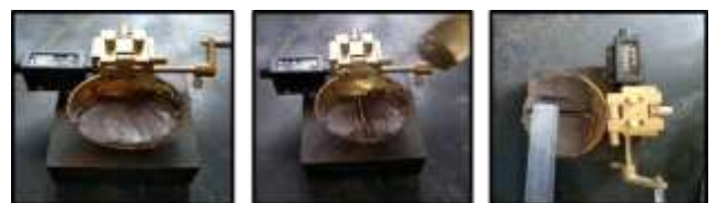
Fig 8 : Liquid limit test

Liquid limit (WL):- The liquid limit is conceptually defined as the water content at which the behavior of a clayey soil changes from plastic to liquid. But experimentally it is defined as the minimum water content at which two separated grooved soil parts mixed together under 25 blows of Casagrande's Liquid Limit Apparatus.