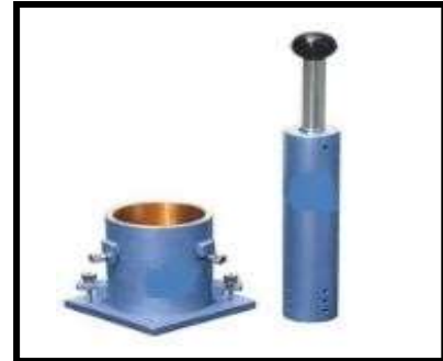
Fig 10 : OMC and MDD of black cotton soil

Maximum Dry Density (M.D.D): It is the Maximum value of dry density obtained in compaction curve, is known as Maximum Dry Density.