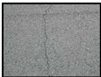
Fig 4 : Longitudinal cracking

Longitudinal cracks become similar to the midline of the roadway. They can be caused by: poorly constructed joint, Asphalt layer shrinkage, Cracks reflected from the underlying layer, And longitudinal separation due to improper paving operation.