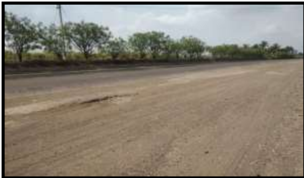
Fig 1 : Before Rainfall

Recently, traffic and transportation systems are increased in the Sangli district. So most of the vehicles are goes on Sangli Islampur road. Recently this road is converted into a national highway. So it is necessary to keep it in good condition and maintenance. Most of the time that road is constructed but that road is frequently deteriorated and get cracks. So people are facing problems while traveling on that road. To solve that problem we choose this project, so in this project, we will find the causes of road deterioration and remedial measures of it.