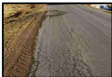
Fig 4 : Edge Cracking

Edge cracks travel within one or two feet of the internal edge of the roadway surface. The most common cause of this type of crack is unfortunate drainage conditions and lack of support on the sidewalk. As a result, the base material becomes stagnant and weak.