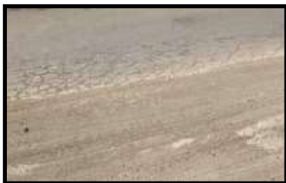
Fig 3 : Fatigue cracking

Fatigue crack is also called as map cracking. It is the most common type of distress in flexible pavement. It is commonly found at interconnection and traffic loading.