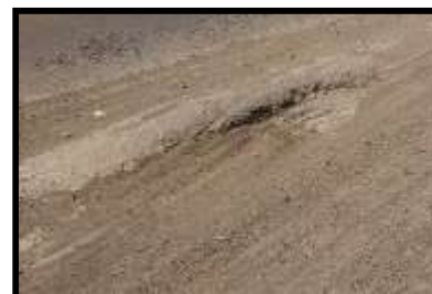
Fig 5 : Slippage cracks

Slippage cracks are crescent-shaped or crescent-shaped cracks with two ends running away from traffic. They form when the sidewalk surface slides and deforms due to braking or turning wheels.