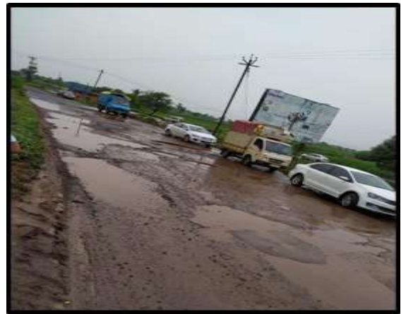
Fig 2 : After Rainfall