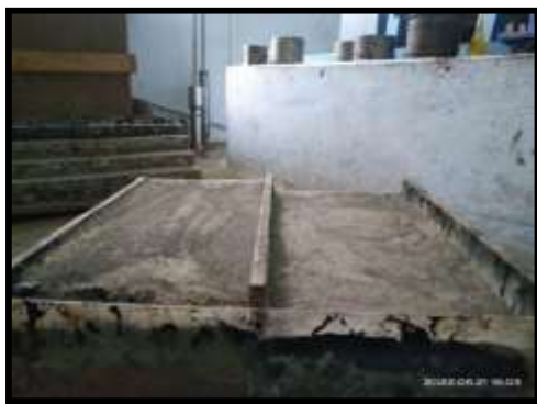
Fig 11 : Model without using brick dust