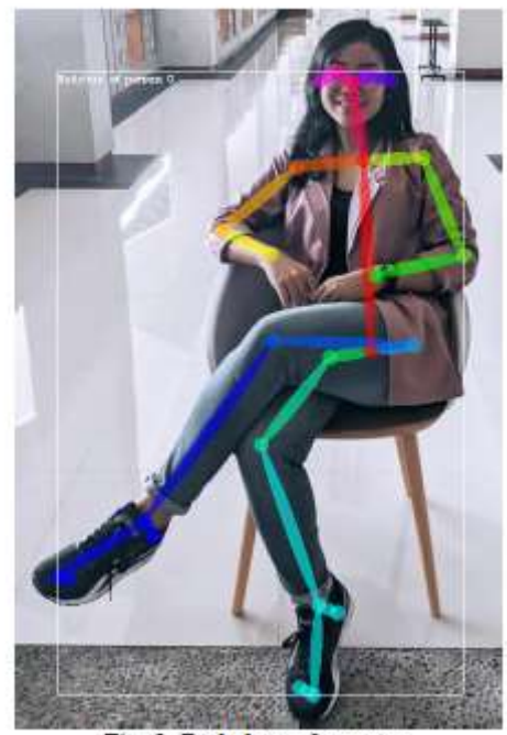
Fig. 2. Body box of a person

The implementation of inference engines marked a critical juncture in our research methodology. Operating on a Ubuntu 18.04 LTS based system configured with dual GPUs – a Geforce GXT 1650 4GB for OpenPose keypoints detection and a Geforce GTX 1660TI 6GB for Tensorflow models – we constructed inference engines to facilitate the extraction of valuable information. This dual GPU configuration was instrumental in optimizing the performance of the engines, ensuring efficiency and accuracy in the analysis of our deep learning models.