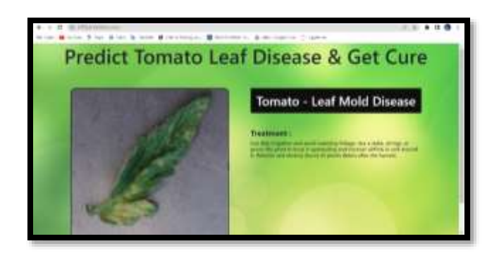
Fig.3: After identifying the disease based on the uploads image

Fig. 2: The Homepage of the work where the user can upload the image of the Tomato plant leaf